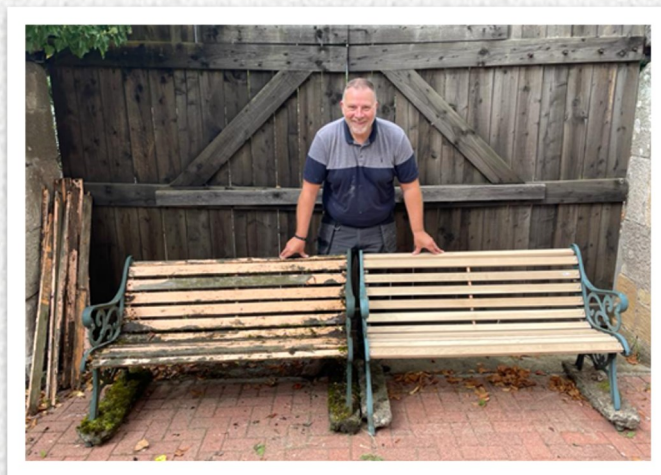
Refurbished Benches, Before and After