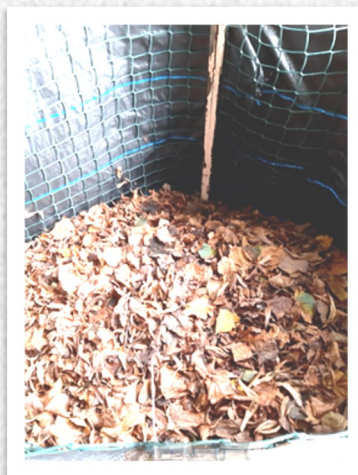
Leaf mould project